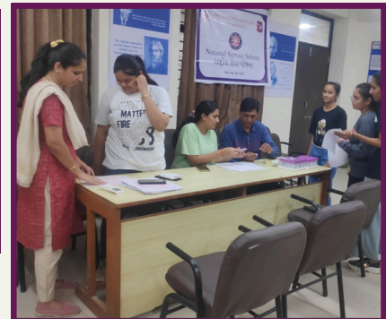
Thalassemia screening camp was organized and conducted successfully in association with Indian Red Cross Society and SRG Eye Hospital.