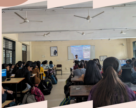
EXPERT LECTURE ON CYBERSECURITY BY MR. DHRUVIL PATEL WITH 68 STUDENTS .