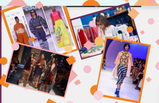
Editor & Compiler