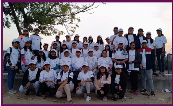
Walkathon was organized by Sanjeevani Life Beyond Cancer, to create awareness on palliative care. The event aimed to raise awareness about the importance of palliative care and contribute to the enhancement of services provided in this crucial healthcare domain, especially to Cancer patients.