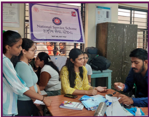
In the medical camp they created awareness of Liver care and on general health care and counseling