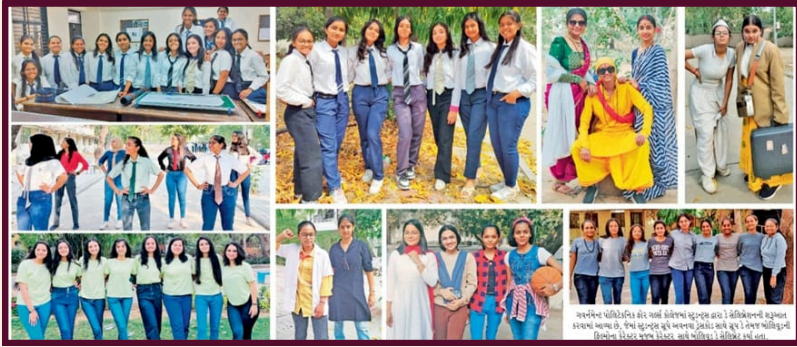
Gujarat samcahar Date: 09/03/2024