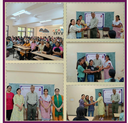
A 5x3 feet wall space was allotted to all 23 teams, where they painted their ideas on various themes like Women's Day, Heritage, Nature, Gender Equality, Vasudhaiva Kutumbakam.