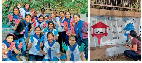
Gujarat samcahar Date: 22/03/2024