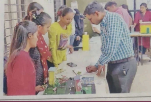
Gujarat samcahar Date: 01/05/2024

ગવર્નમેન્ટ પોલિટેકનિક ફોર ગર્લ્સમાં 'ટેકનો સરિતા ૨૦૨૪' અંતર્ગત બ્રેનયાક બોનાન્ગા દિવસ અને આઈટિયા ઇન્વિઝન પ્રોજેક્ટ કોમ્પિટિશનનું આયોજન કરાયું હતું. આ ટેકનો સરિતામાં આર્કિટેક્ચર, બાયોમેડિકલ, લિટલ, કમ્પ્યુટર, કોન્સ્યુમર ડિઝાઇન, ઇન્સ્ટીટ્યુટીયલ ઇનોવેટિવ પ્રોજેક્ટ અને મોડલ પ્રદર્શિત કર્યા હતા. આ સ્પર્ધામાં વિદ્યાર્થીનીઓએ નવી ટેકનોલોજીનો ઉપયોગ કરીને ઈન્સ્ટ્રી તેમજ પર વપરાશ માટે ઉપયોગી એન્વાયરમેન્ટ સસ્ટેનેબલ દૃષ્ટી વધુ પ્રોજેક્ટ અને મોડલ બનાવ્યા હતા. ડિજિટલ કોમ્પિટિશન અંતર્ગત જનરલ નોલેજ, બિઝિસ સાયન્સ અને ટેકનોલોજી, મેન્ટલ એબિલિટી, રીઝનિંગ અને આપણા બંધારણને લગતા પ્રશ્નોની ચર્ચા વિવિધ ડિપાર્ટમેન્ટની ૮ ટીમ વચ્ચે કરવામાં આવી હતી. ટેકનો સરિતાનો મુખ્ય હેતુ વિદ્યાર્થીનીઓમાં સ્કિલ ડેવલપમેન્ટ, ટીમ મેનેજમેન્ટ, લીડરશીપ વર્ધ આ સાથે નવી ટેકનોલોજીનો ઉપયોગ કરીને તેઓ સંશોધનાત્મક કાર્ય કરે તે માટેનો હતો.