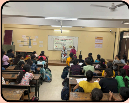
Expert lecture on "Women's health issues, Menstrual cycle and diet" for Girls students