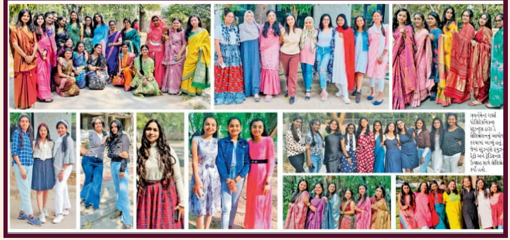
Gujarat Samachar Date: 06/03/2024