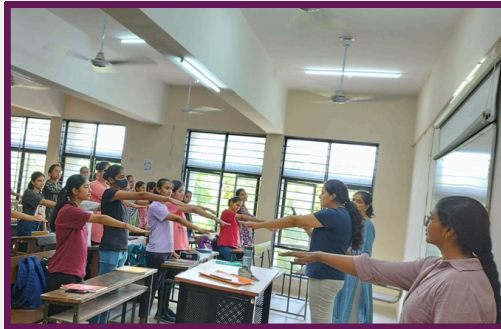
Voter awareness programme was carried out on campus to create awareness among youth on their voting rights, making them aware of the power of their vote.