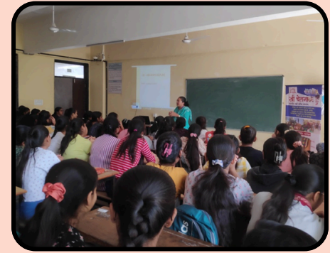
181 abhiyam Mahila Help line