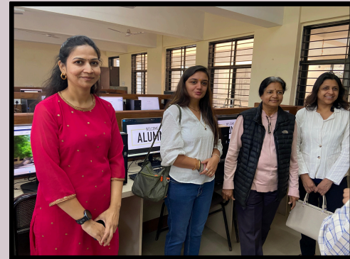
INAUGURATION OF NETWORKING FACILITY AT EC/ICT DEPARTMENT