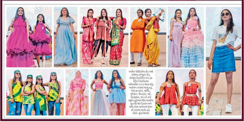
Gujarat samcahar Date: 20/04/2024

ગવર્નમેન્ટ પોલિટેકનિક ફોર ગર્લ્સ કોલેજ ખાતે એન.એસ.એસ. ટીમ દ્વારા ઈન્ક એન્ડ ઇમેજિનેશન પેઇન્ટિંગ કાર્યક્રમનું આયોજન કર્યું હતું. આ કાર્યક્રમમાં કોલેજની વોલ પર સ્ટુડન્ટ્સે વિવિધ વિષય પર જેવા કે વિમેન ઓફ ઈન્ડિયા, નેચર, હરિટેજ ઓફ ઈન્ડિયા, જેનર ઇક્વાલિટી અને વસુધૈવ કુટુંબકમ પર પેઇન્ટિંગ કર્યા હતા.