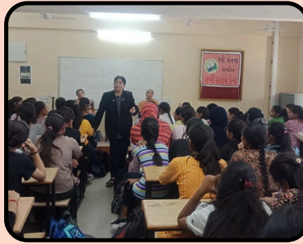
Program for Explaining the Laws related to Women's safety