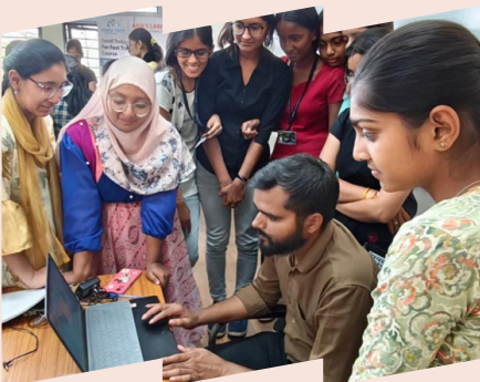
A WORKSHOP ON MICROCONTROLLERS AND AUTOMATION WAS CONDUCTED BY XYZ, WITH 55 STUDENT PARTICIPANTS.