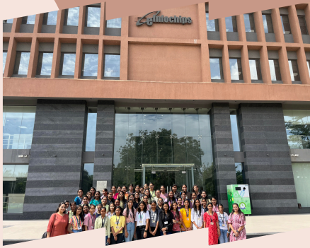
VISIT TO EINFOCHIPS BY THE COMPUTER DEPARTMENT WITH 3RD AND 5TH SEMESTER STUDENTS.