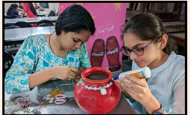
GARBA DECORATION COMPETITION