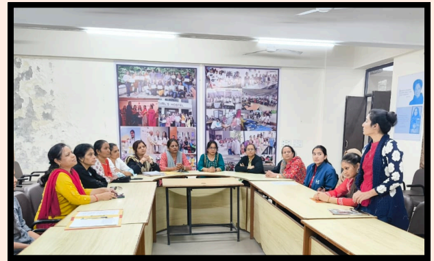
LPG ALUMNI MEET- 21/12/2024