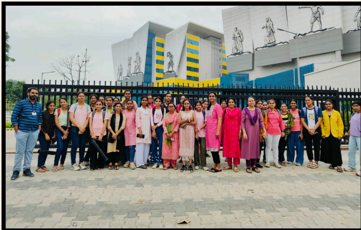
VISIT TO SABARMATI RAILWAY STATION