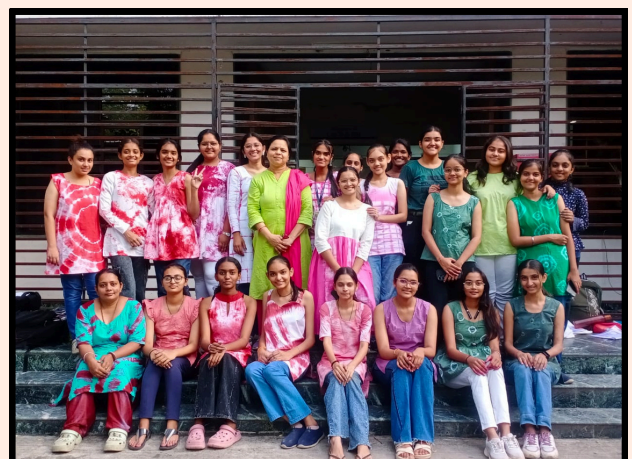
COLOURFUL CREATIONS BY YOUNG ARTISTS