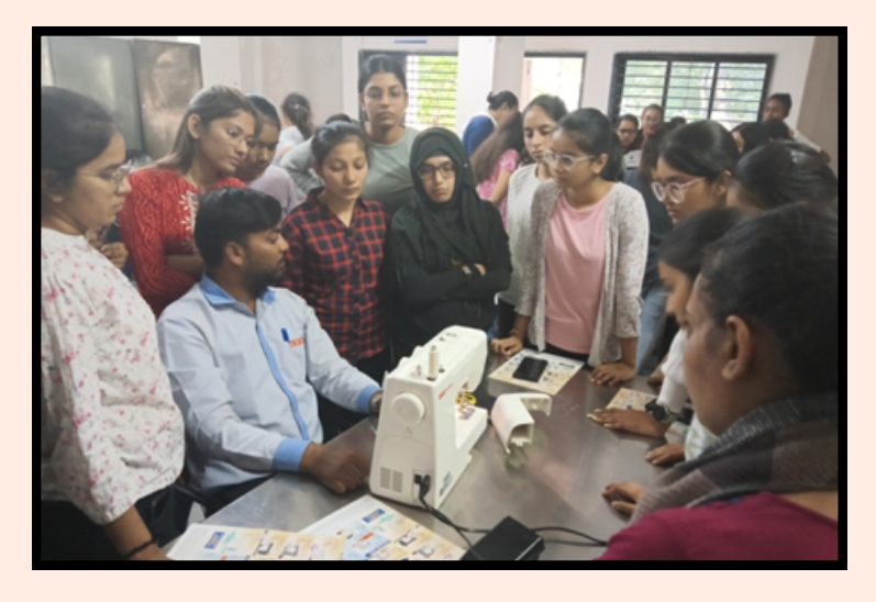
DEMONSTRATION OF LATEST SEWING MACHINE

These sessions provided students with valuable practical experience and exposure to industry expertise.