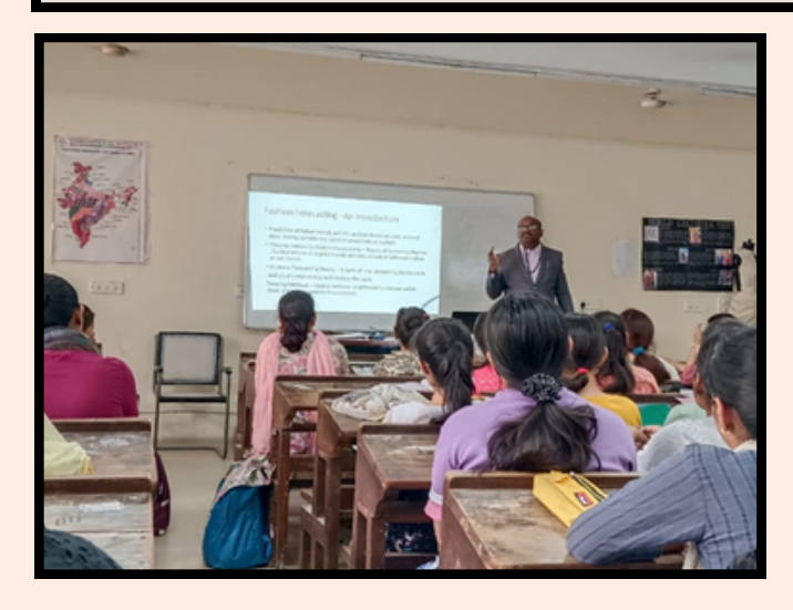
FASHION FORECASTING 04-2024

These lectures provided comprehensive knowledge and essential skills, aligning with the department's commitment to excellence.