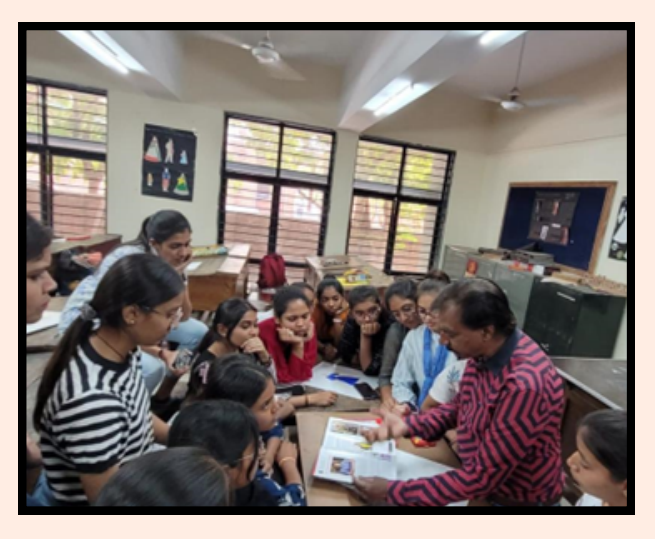
RENDERING TECHNIQUES - 09/04/24