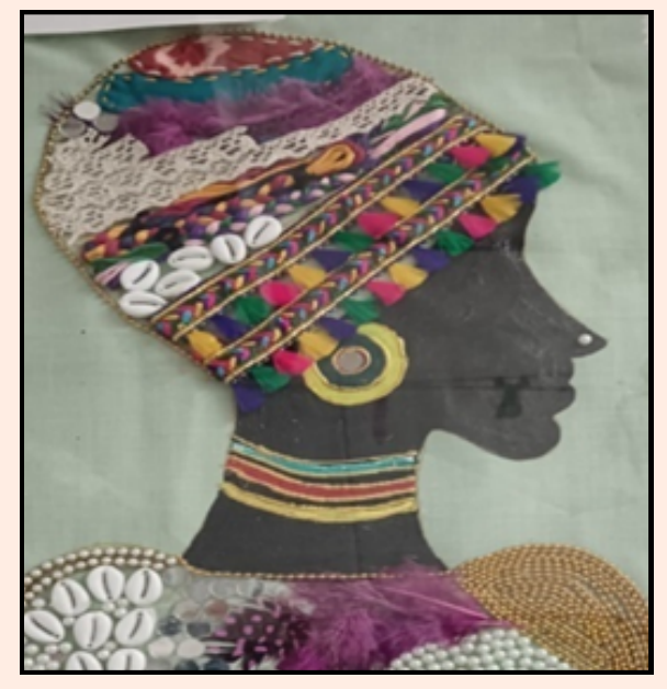
"ART IS A WOUND TURNED INTO LIGHT." - GEORGES BRAQUE