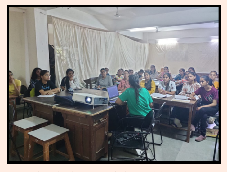
WORKSHOP IN BASIC AUTOCAD