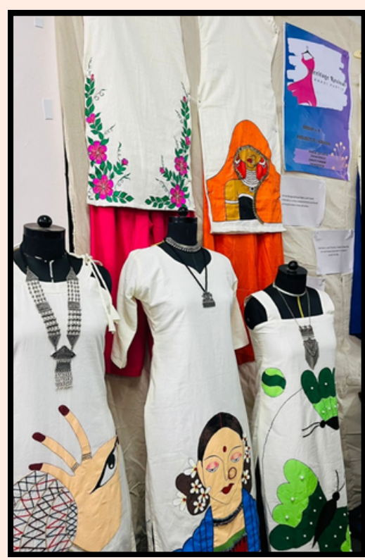
FASHION SHOW- ABHVYAKTI-2024 16/04/2024