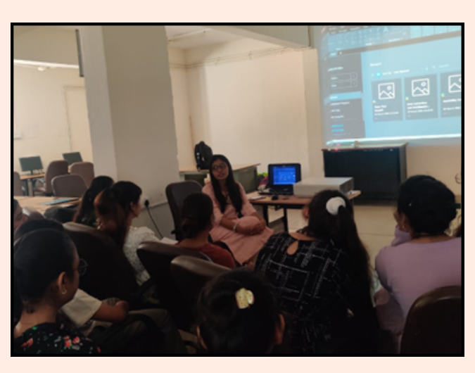
ADVANCE AUTOCAD 21-03-24