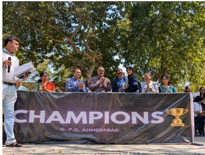
Cricket (Player of the Tournament)