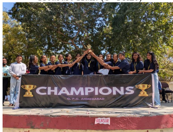
Cricket (1 st Prize)