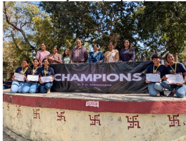
Treasure Hunt (1 st Prize)