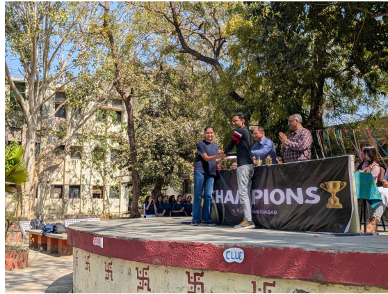
Chess (1 st prize)