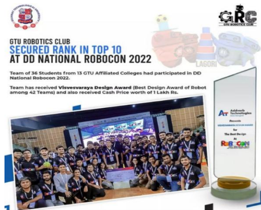
DD National Robocon 2022