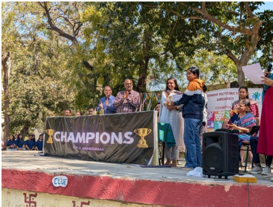
Table Tennis (2 nd prize)