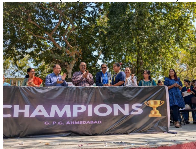
Cricket (Player of the Match)