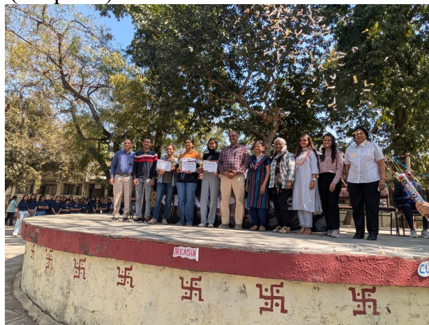
Table Tennis Winners