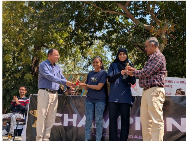
Relay Race (2 nd prize)