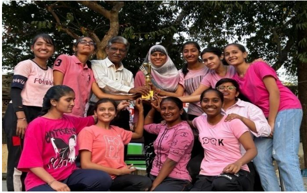
Winners: Cricket Competition (1 st Prize)