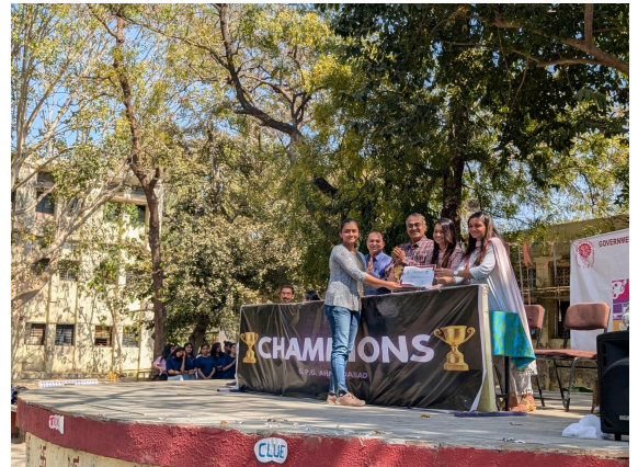
Table Tennis (3 rd prize)