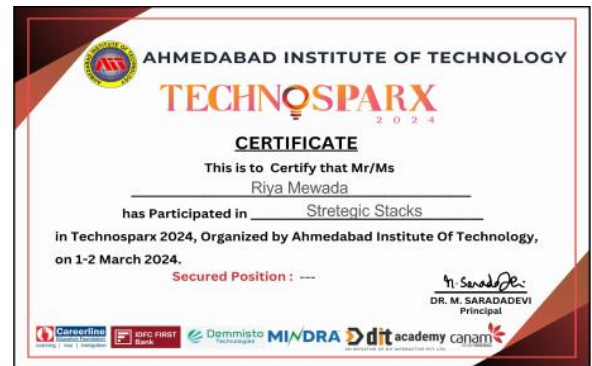
Certificate of Inter-Institute Participation